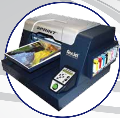
Step 1: Print your image on ARTprint Canvas™.