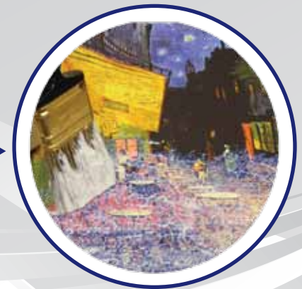
Step 3: Apply ARTprint Texture Coat™.