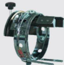
1 piece of hoop station per machine