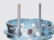
2 pieces of cap rings per head