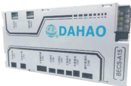
Integrated Control System