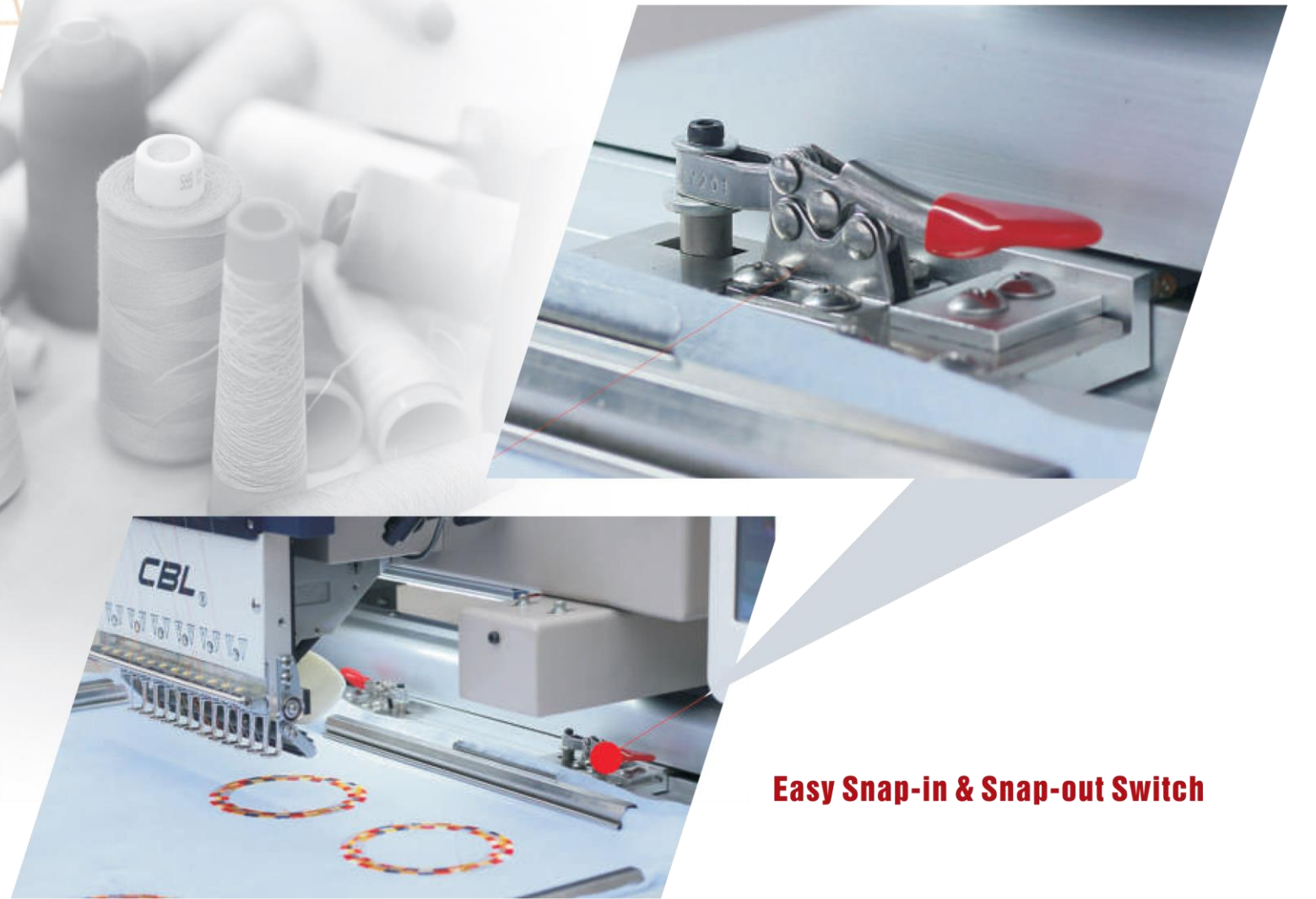
Easy Snap-in & Snap-out Switch

We reserve the rights to change the specifications or design without prior notice. No design or registered trademark of the products contained within this document may be used without prior permission .