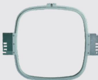
2 pieces of 300*300mm hoops per head