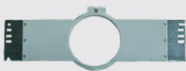
2 pieces of 120mm hoops per head