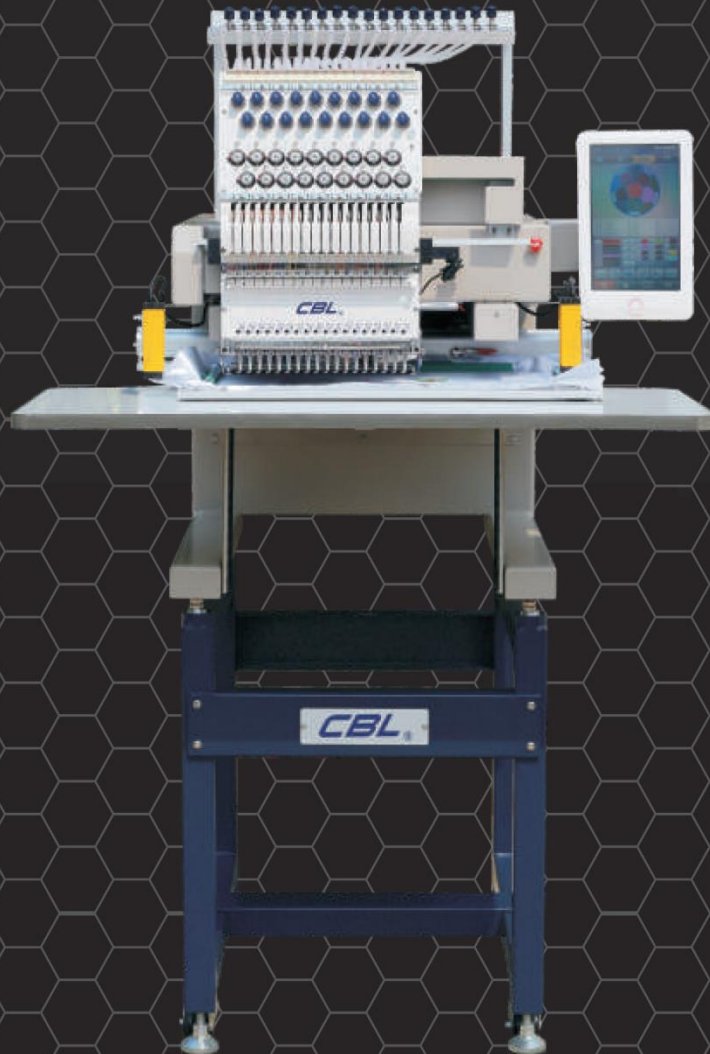
CBL SC Series Embroidery Machine: CBL-1801SC