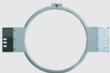
2 pieces of 240mm hoops per head