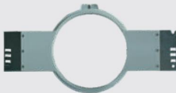
2 pieces of 180mm hoops per head