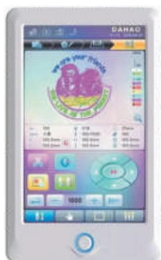
10.1" Touch Panel