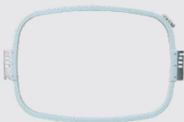
2 pieces of 480*340mm hoops per head (for single head model only)